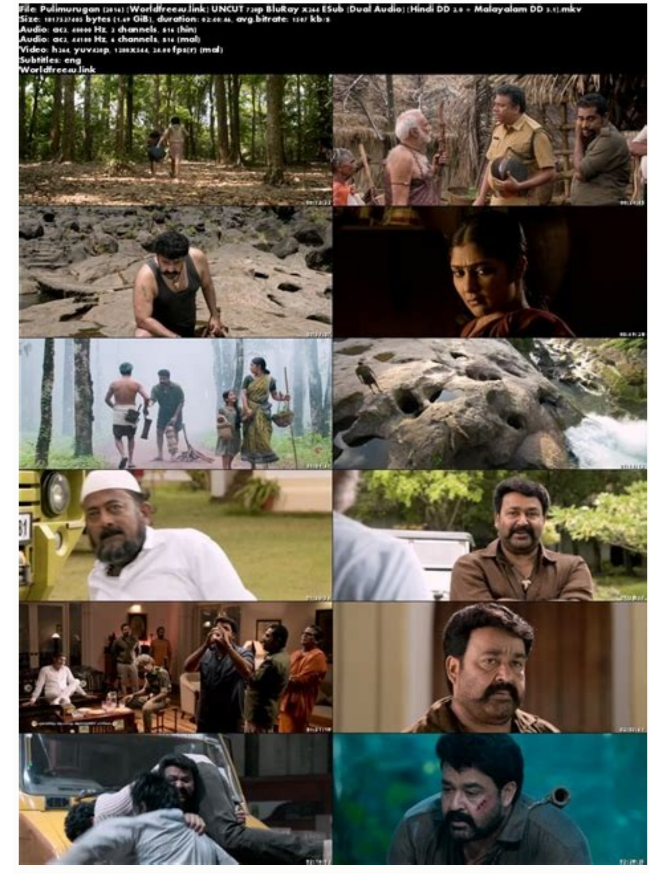
Pulimurugan malayalam full movie free download hd 1080p.

Large-sized flatscreen TVs are usually full HD, but small ones usually aren't Full HD 1080p is the new buzzword in the TV market. According to analyst iSuppli, TV buyers are becoming more aware of what's hot and what's not in the flatscreen market, and more of us are now prepared to pay more for the full-HD experience. "The dramatic increase in availability of full-HD products is spurring impressive growth for LCD TV sales, mostly due to consumer demand," said Riddhi Patel, hotshot analyst at iSuppli. "For television brands, full HD is also a way for them to differentiate themselves from their competition as well as to charge more for the displays they sell." LCD revenue to soar We've seen a huge rise in the number of sets touting themselves as Full HD this year - even more so now that the Christmas marketing push is well under way. iSuppli has predicted that worldwide revenue from 1080p LCD TVs will grow to $75.4 billion (£37bn) by 2011, increasing by 81.7 per cent from 2006. And it's not just the LCD market that's expanding either. According to Jim Palumbo, president of the Plasma Display Coalition, 1080p has been the driving force in the plasma market for the last six months. Sales of plasma sets over the last few months have risen by 21 per cent compared to last year. It's no real surprise that it's taken until now for people to start switching themselves onto the benefits that